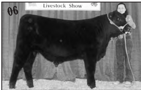
Foreman (X) 1418 Class Winning Angus Bull Calf - WJLS