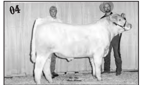
04 2003 Champion Over All Breeds Bull Mid-Dakota 2003 Champion Yearling Charolais Bull BHSS 2003 High Selling Charolais Bull BHSS