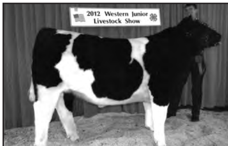
2012 Eye Candy Market Steer Shown by Trevor