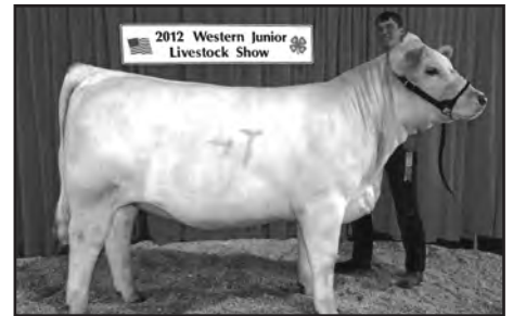
SD 2012 High Point Champion Charolais Heifer Shown by Trevor Fire Maker daughter