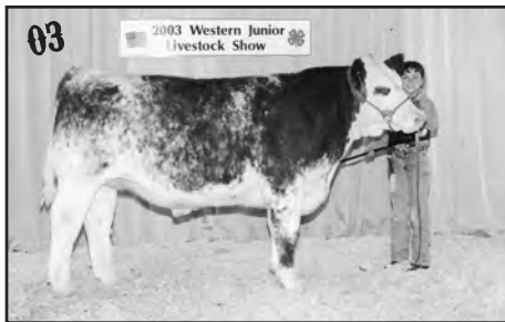
03 Class Winning steer - WJLS Rapid City 3rd Place Overall Futurity Market Steer - WJLS Rapid City (This steer was shrunk 140' pounds in 15 days before the show to make weight and still graded choice+)