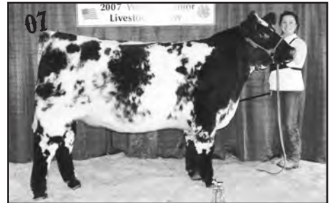
GRAND CHAMPION HEIFER SD State Fair Shorthorn Special • SD State Fair 4-H Show Brookings County Invitational • Brookings County Achievement Days Reserve Champion - SD State Fair open class • Reserve Champion WJLS 3rd Place Shorthorn Junior Nationals Shown by Kaylea