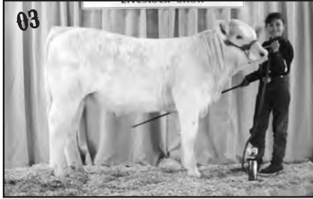
03 Reserve Champion Charolais Bull - WJLS Reserve Champion Exotic Bull - Mid Dakota Reserve Champion Overall Breeds Bull Mid Dakota Shown by Kaylea