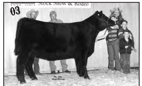
03 Reserve Champion Angus Bred Heifer ACC Bando 598-909 daughter