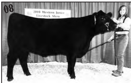
Grand Champion English Bred Heifer Shown by Tanya