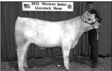
2012 WJLS Reserve Champion Charolais Bull Shown by Trace