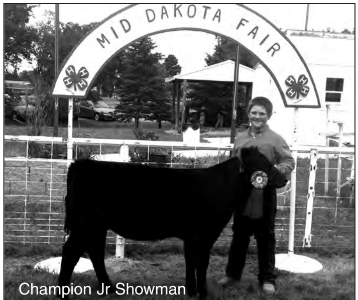
Champion Jr Showman