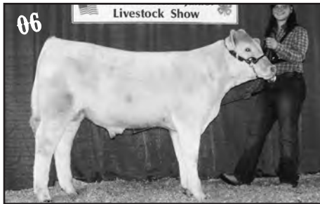
06 Grand Champion Charolais Bull - WJLS