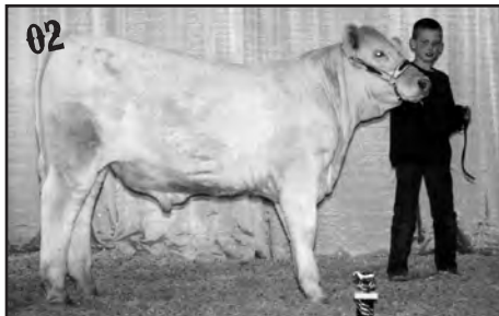
02 Grand Champion Exotic Bull - Mid-Dakota Fair Grand Champion All Breeds Bull - Mid Dakota Fair Reserve Champion Other Breeds Bull - WJLS Shown by Trevor • Sired by Cigar