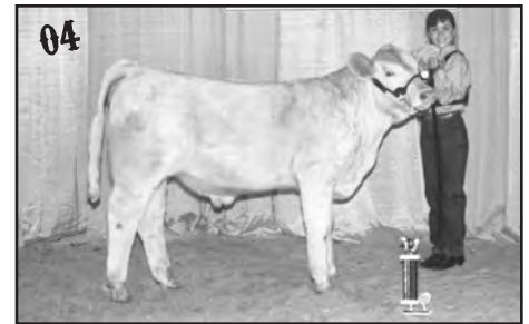
04 2004 Grand Champion Charolais Bull - WJLS - Rapid City 2004 Grand Champion Cow/Calf Pair Owned & Shown by Kaylea