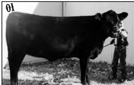
01 Reserve Champion 2001 Bred & Owned Bred Heifer