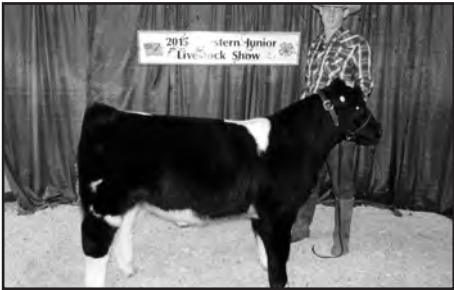
2015 WJLS 2nd Place Steer Shown by Trace