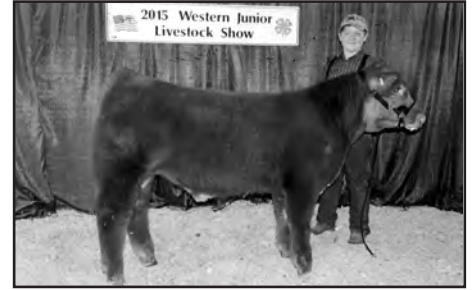
Shown by Jesse