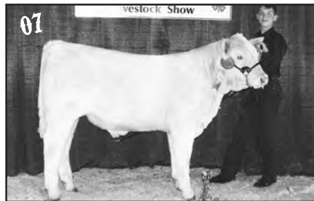
Grand Champion Charolais Bull - WJLS Shown by Trevor