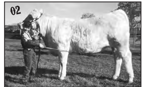
02 Grand Champion Charolais Heifer - WJLS Sired by RA Big Cat - Mother to KL Big Festus Owned & Shown by Kaylea