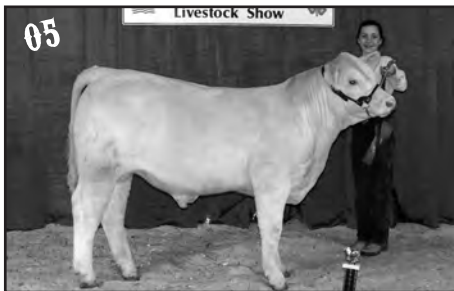
05 Cigar X Blizzard Grand Champion Bull - Mid-Dakota • Grand Champion Charolais Bull - WJLS Reserve Champion All Breeds - WJLS Purchased by Dave Miller & Bernard Donahue BHSS - 1/2 Interest